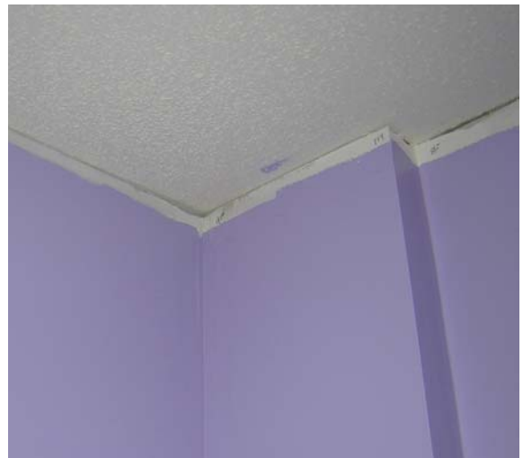
Corners #2, 3 & 4