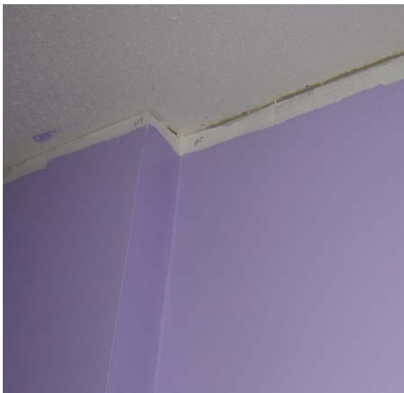
Corners #3 & 4

Rename your photos to indicate all of the corners shown in the photo. Attach all information to an email and send to Wayne@CompoundMiter.com